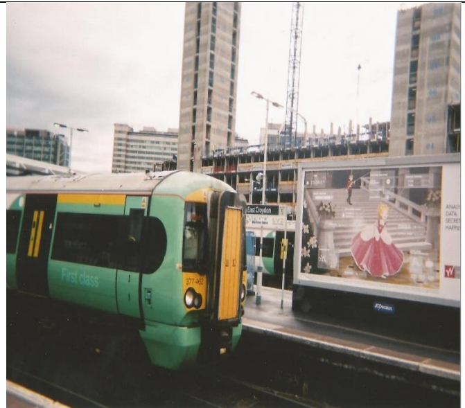
Caption Above: A Southern Train at East Croydon, a growing south London area and busy rail interchange. ERTA has long called for direct running via Redhill for Guildford and possibly Reading with electrification.