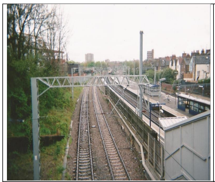
Caption Above: Shows the two lines which ERTA believes should have platforms at West Hampstead Thameslink Station. Trains from Gospel Oak to Heathrow and Reading could connect here, making more for more.