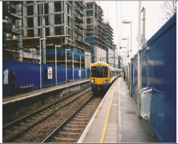
Caption Above: The North London Lines link places like Stratford and Barking with Richmond and many places in between. Heavily used, other lines could boost capacity.