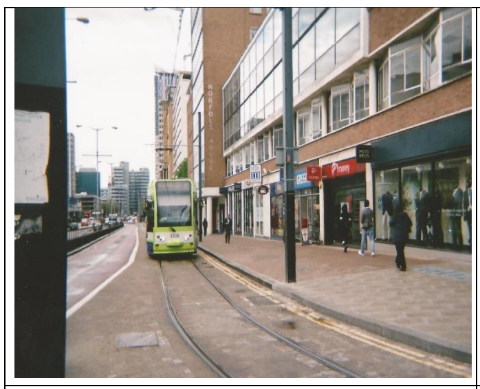
Caption Above: Croydon Tramway and Trams were bitterly opposed in the early days several decades ago, but have proved a success and popular for diverse mobility.