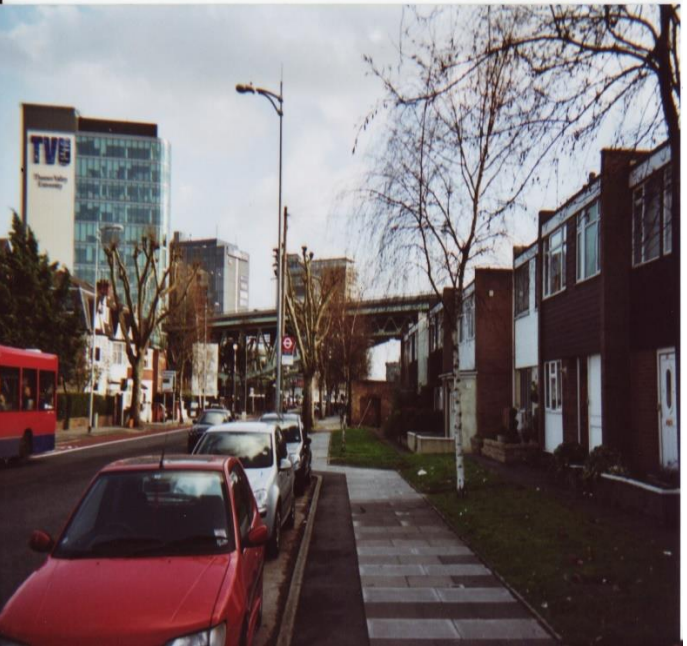
Caption Above: West Ealing, London, with M4 over-bridge in background. Roads have intruded the heart and soul of London but delivered pollution and more traffic too.